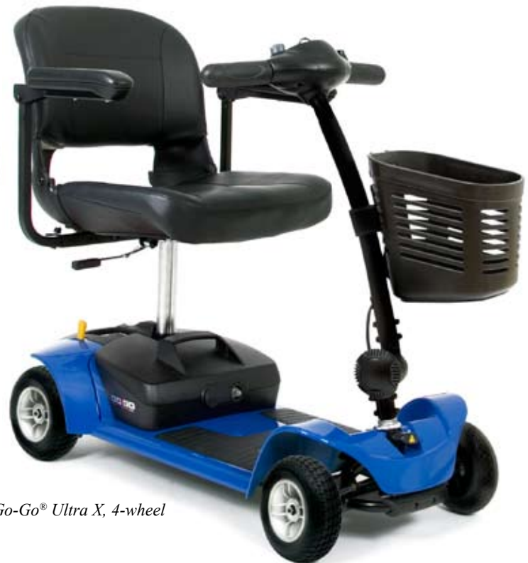
Go-Go ® Ultra X, 4-wheel