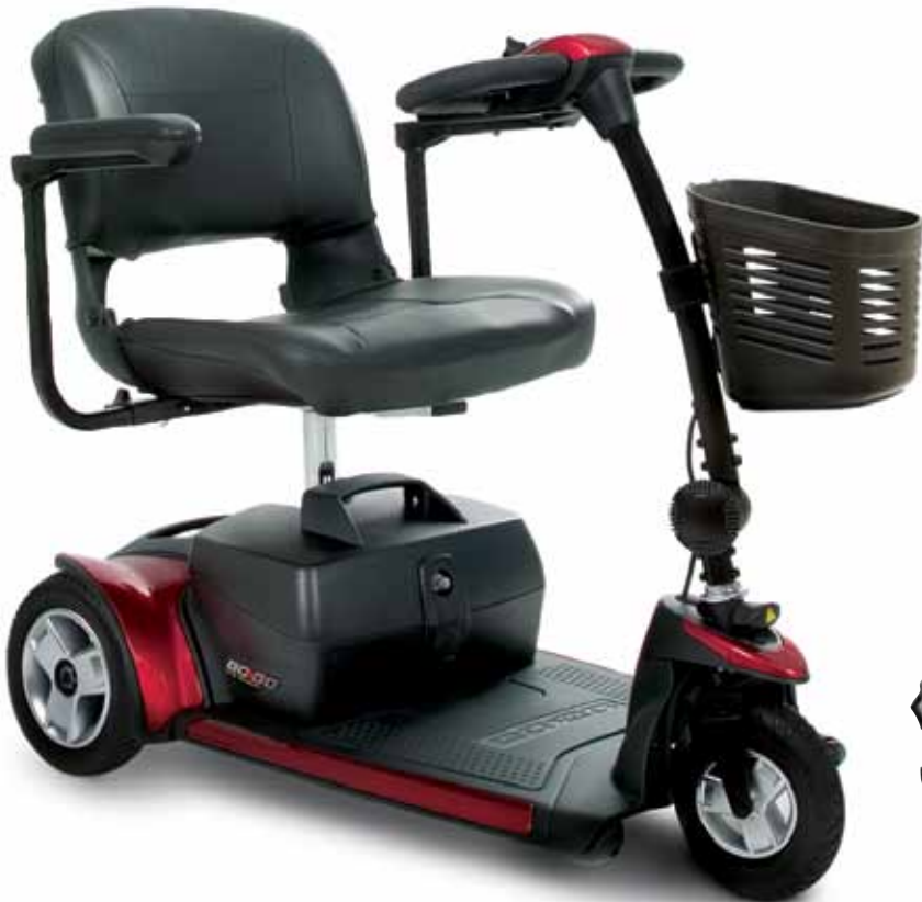
Go-Go Elite Traveller® Plus, 3-wheel

The Go-Go Elite Traveller® Plus was designed to bring travel scooters to a greater range of people than ever before. An increase in length and width, and a weight capacity of 300 lbs. (325 lbs. w/HD version) combine with wraparound delta tiller to allow both the larger individual and those with limited dexterity to experience the benefits of a travel specific mobility product for the first time. One hand Feather-touch disassembly makes the Go-Go Elite Traveller Plus the easiest travel scooter to take along anywhere.