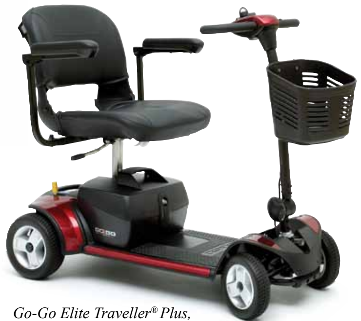
Go-Go Elite Traveller® Plus, 4-wheel

The Go-Go Elite Traveller® Plus was designed to bring travel scooters to a greater range of people than ever before. An increase in length and width, and a weight capacity of 300 lbs. (325 lbs. w/HD version) combine with wraparound delta tiller to allow both the larger individual and those with limited dexterity to experience the benefits of a travel specific mobility product for the first time. One hand Feather-touch disassembly makes the Go-Go Elite Traveller Plus the easiest travel scooter to take along anywhere.