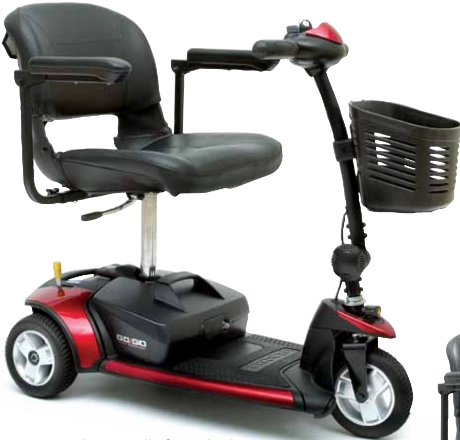
Go-Go Elite Traveller® , 3-wheel