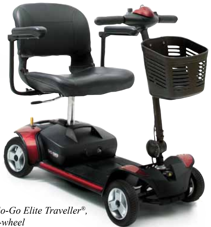
Go-Go Elite Traveller® , 4-wheel

The Go-Go Elite Traveller®'s compact design allows it to easily maneuver in tight spaces while providing stable outdoor performance. Take the guesswork out of travel with simple, one hand Feather-touch disassembly. Go where you want to go, easily, with the Go-Go Elite Traveller.